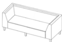
ELE2-ALR-W (Two seat sofa)

In order to assist you with your Elements and Elements Plus order, it is essential that you send us your configuration with your sales order to sales@nomique.com.