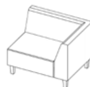
ELE1-CBL-W (Single seat with corner arm on LEFT side whilst seated - wooden beech leg)