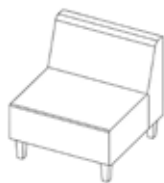
ELE1-SB-W (Single seat with straight back - wooden beech leg)