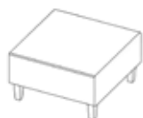
ELE1-W (Single seat bench - wooden beech leg)

Elements core – seat/back combination and code