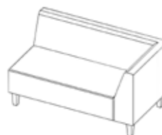
ELE2-CBL-W (Double seat with cor- ner arm on LEFT side whilst seated - wooden beech leg)