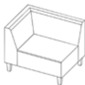
ELE1-CBR-W (Single seat with corner arm on RIGHT side whilst seated - wooden beech leg)