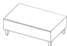
ELE2-W (Double seat bench - wooden beech leg)