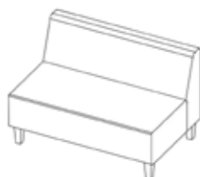
ELE2-SB-W (Double seat with straight back - wooden beech leg)